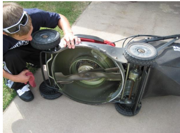
Inspect the blade for cracks and dents. When inspecting the blade, always tilt the mower with the carburetor in the air.