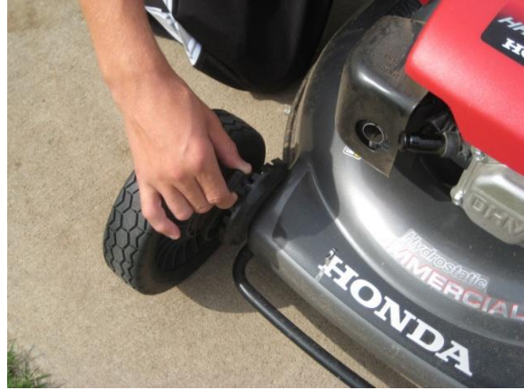
Adjust the cutting height before you begin mowing.