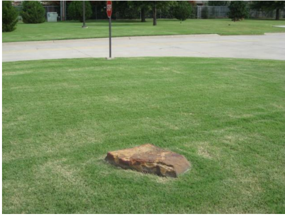
Spot all obstructions so that you can safely mow around them.