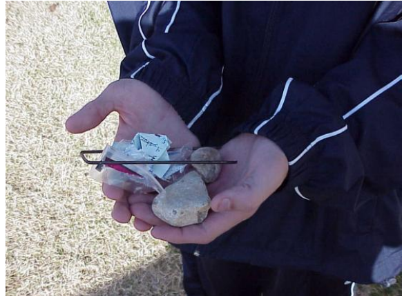
Gather up loose objects from the lawn. These can damage the blade and become dangerous projectiles.