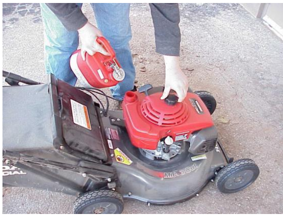
Fuel up outdoors and away from the grass. Be sure to wipe up all spills. Never refuel a running or hot engine. If you have been mowing and you run out of gas, let the mower cool down for several minutes before you begin refueling.