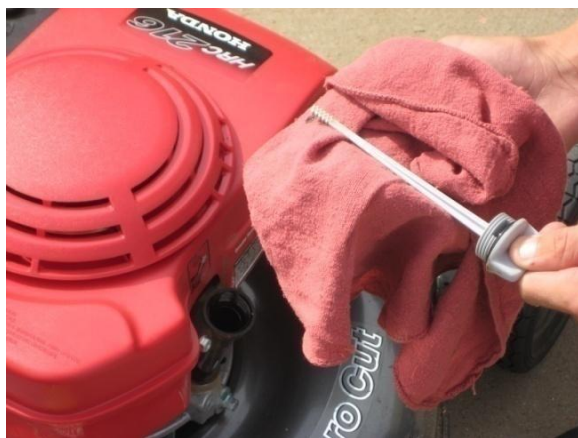
Check the oil. Make sure the oil is clean and reaches the fill line on the dip stick.