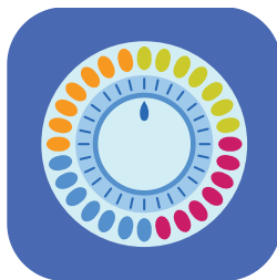
Birth Control Pill