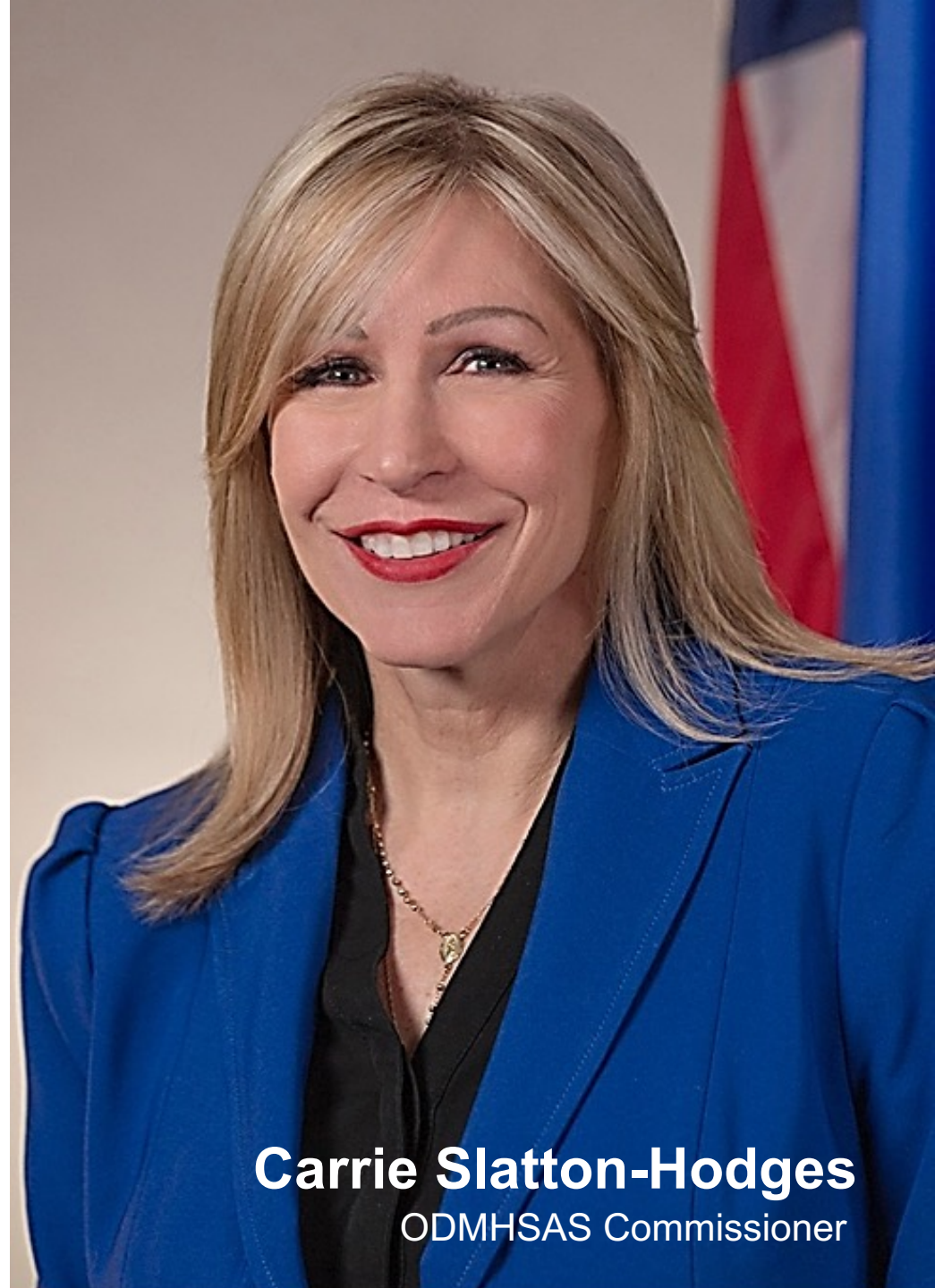
Carrie Slatton-Hodges ODMHSAS Commissioner