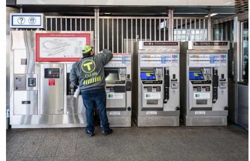
Massachusetts Bay Transportation Authority (MBTA) disinfecting ticket vending machines.