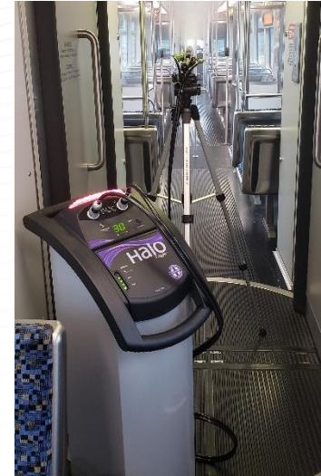
Dallas Area Rapid Transit (DART) using an EPA-approved fogging technology to disinfect a Light Rail Vehicle.

A. The issues with paratransit are more complex and may vary based on the use of paratransit in your area. Each transit agency should establish medical guidelines for paratransit that specifically address policies and procedures related to COVID-19.