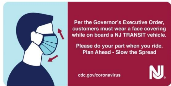
New Jersey Transit advertisement to riders (April 2020)