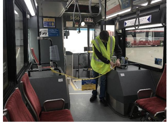
Capital Metro distancing passengers from the operator.