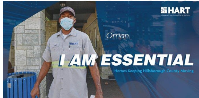
Hillsborough Area Regional Transit Authority (HART) advertisement (April 2020)

Additionally, individuals must have access to food, pharmacies, and other essential medical services such as kidney dialysis and cancer treatments during periods of social distancing and shelter-in-place orders across the country. The American Public Transportation Association (APTA) estimates that public transit will provide at least 880 million trips from April through June of 2020. Providing continuity of transit service is an imperative. Therefore, agencies must maximize their efforts to protect the safety of riders and staff.