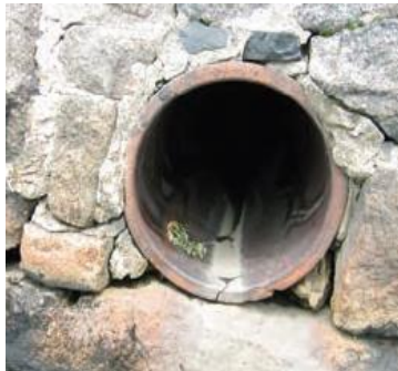
White stain (intermittent discharge)