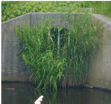
Over flourishing vegetation