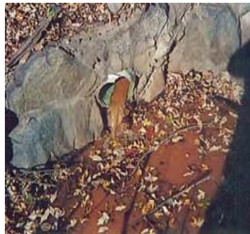
Brown (highly turbid) discharge