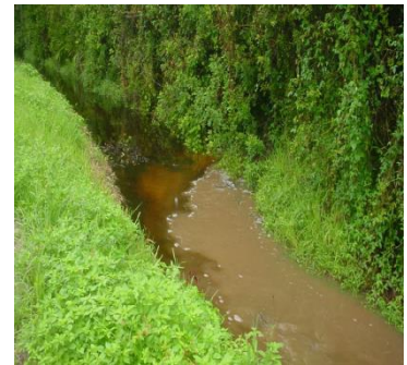
Brown (moderately turbid) discharge