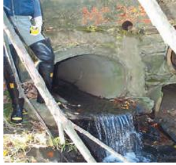
Moderate (clear) flow