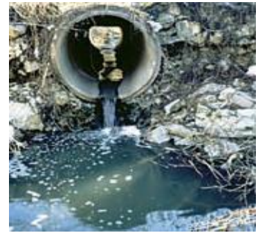
Foam / suds