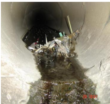
Floatables (plastics, debris etc)