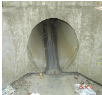
Grey-black stain (intermittent discharge)