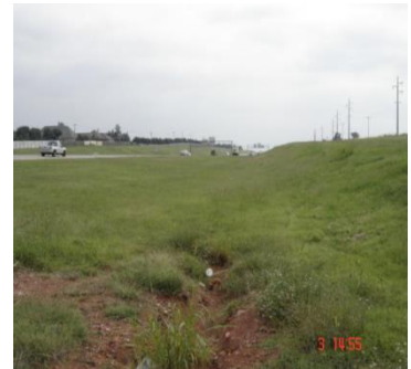
Normal vegetation (erosion)