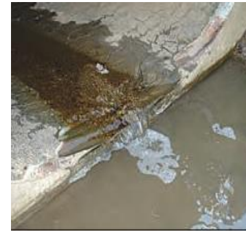
Foam / suds