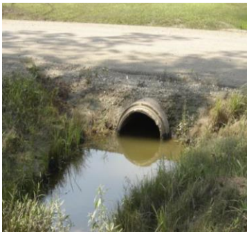
Turbid standing water