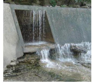
Significant (clear) flow