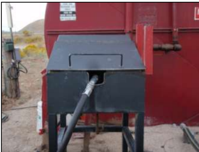
6,000 Gallon Diesel AST – Custom Fabricated Dispenser Nozzle Holder

Periodically, accumulated stains (less than 5-gallon volume) are scooped up. Generally, all media resulting from cleanup of non-reportable quantities of petroleum products are placed in a 55-gallon drum and appropriately secured. Once the drum is filled, a composite sample is collected to characterize the waste and evaluate disposal options, which may include treatment prior to disposal or direct deposit in our dumpster, upon approval from the local landfill. Also keep in mind that any accumulated stormwater in this lined area must be periodically pumped. We check for presence of an oil sheen prior to pumping. If no sheen is present, it is safe to upland infiltrate adjacent to the AST. If there is a sheen, we call an oiler to suck up the contaminated water for disposal/recycling. Generally, if you secure an oil absorbent boom (some come with carabiners) in the corner of your sump, then most if not all of the oil product is absorbed. It is obvious when it is time to replace the boom because the dominant color shifts from white (new out of the package) to dark brown. You can dispose of the used boom in a dumpster as long as no free product is present. Remember to document containment area drainage events with the SPCC plan.