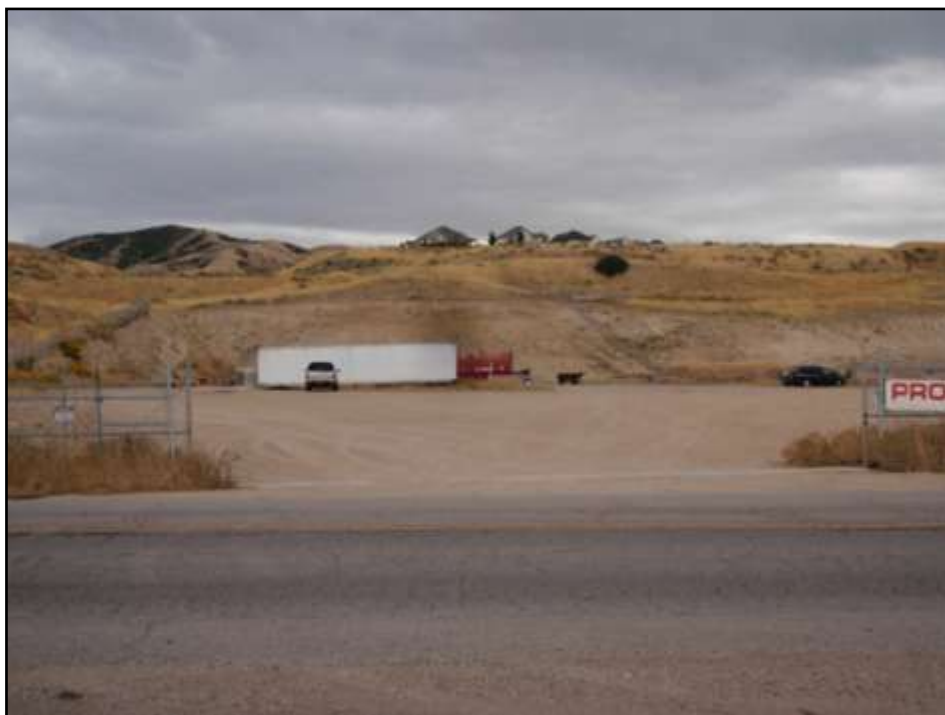
6,000 Gallon Diesel AST – Security Perimeter Fence – Gate Is Closed and Locked at the End of Every Shift

I encourage you to spend the time upfront and develop a template plan for your company (Tier II facilities) and familiarize yourself with EPA's template (Tier I facilities). You will still have to fill out forms for each site that must comply with the SPCC requirements, but these templates will save you time and expense in the long run.