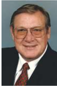
Secretary of Transportation Herschel Crow