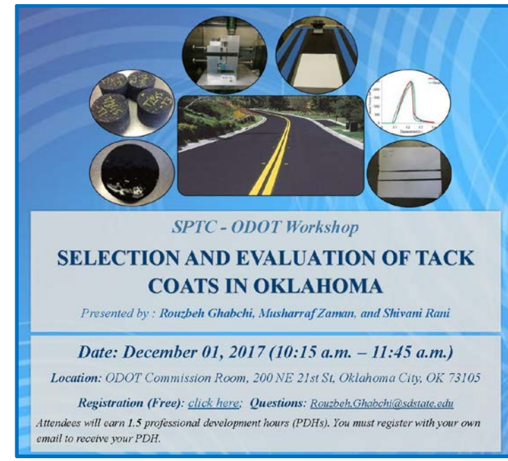
Figure 2. Flyer announcing Workshop to be held at ODOT

The OTL also assists ODOT in making the SP&R Final Reports compliant with accessibility standards under the Americans with Disabilities Act.