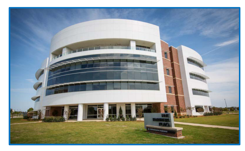
Figure 1. The Oklahoma Transportation Library

The Oklahoma Department of Transportation (ODOT) seeks to maintain and operate a sound, progressive, and flexible transportation library, which is available to users at ODOT as well as users throughout the transportation community. The OTL is located at The University of Oklahoma (OU), Norman Research Campus, at Five Partners Place, Suite 4200.