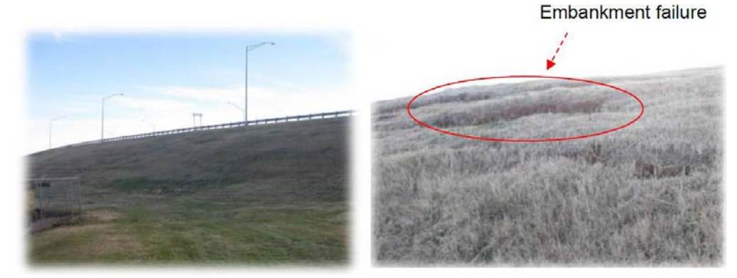
Figure 1 Failed slope of a highway embankment in Chickasha, Oklahoma

OVERVIEW Oklahoma Department of Transportation (ODOT) and other departments of transportation in the U.S. are continually faced with the persistent problem of landslides and slope failures along highways, such as the failure shown in Figure 1 . Repairs and maintenance work associated with these failures cost these agencies millions of dollars annually. Reinforced soil technology using locally available materials can provide viable and economical solutions to stabilize or reconstruct highway slopes and embankments. However, in order to reinforce embankment structures that are built with marginal soils, which are common in Oklahoma, it is important to obtain satisfactory soil-reinforcement interface performance.