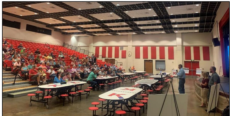
Figure 2: Roosevelt Bridge Public Meeting, July 25, 2023

ODOT concluded a six-week virtual public open house at www.odot.org/US70LakeTexoma in August 2023. Because US-70 is a significant regional facility, and Lake Texoma attracts visitors from a large area, on-line engagement was included to reach these users as well as to provide a convenient way for the public to access Project information. In six weeks there were over 2,600 unique visitors to the website and over 280 comments submitted 1 . ODOT also held an in-person public meeting on July 25, 2023, in Kingston, OK (Figure 2). Over 140 people attended the public meeting, where ODOT staff gave a presentation on the Project and answered questions. All but two of the comments received from the public expressed a desire for a new bridge due to safety concerns or to increase capacity. Stakeholder and public meeting summaries are included at ODOT Roosevelt Bridge .