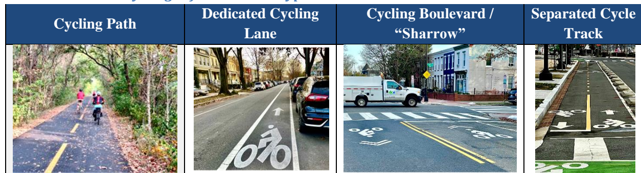
Table 2: Common Cycling Infrastructure Types

The monetization values in Appendix A, Table A-9 should only be applied over project sections for which a comparable parallel facility is not available, and only to miles cycled on the proposed project facility. Additionally, the estimated value per projected cyclist on a proposed facility should be capped at 2.38 miles, the average length of a cycling trip in the 2017 National Household Travel Survey, unless the applicant has specific documentation suggesting longer trips (as may be the case when a trip shorter than 2.38 miles is not feasible on the facility in question or on recreational facilities). In other words, applicants should not assume all cyclists travel the full distance of a proposed facility if the facility is longer than 2.38 miles, unless they have a clear justification for doing so, such as a detailed demand analysis or existing observations suggesting a different average trip distance.