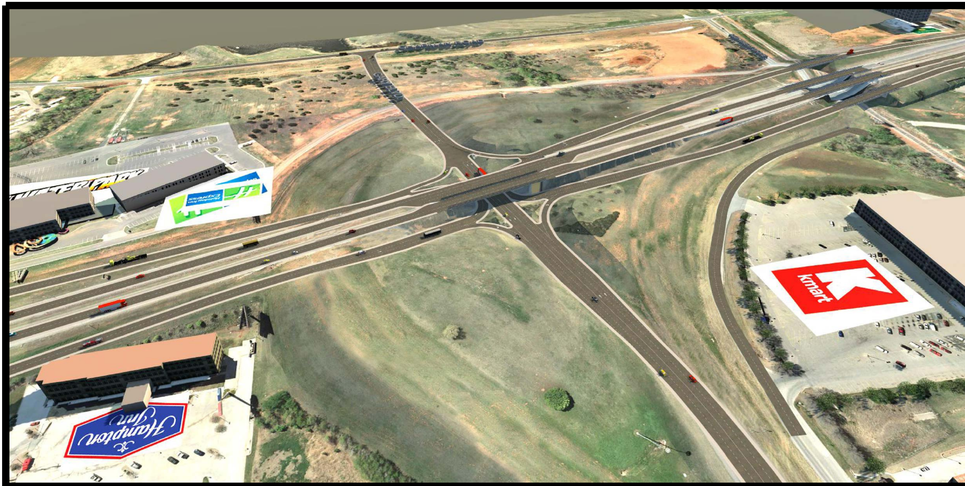
SINGLE POINT URBAN INTERCHANGE