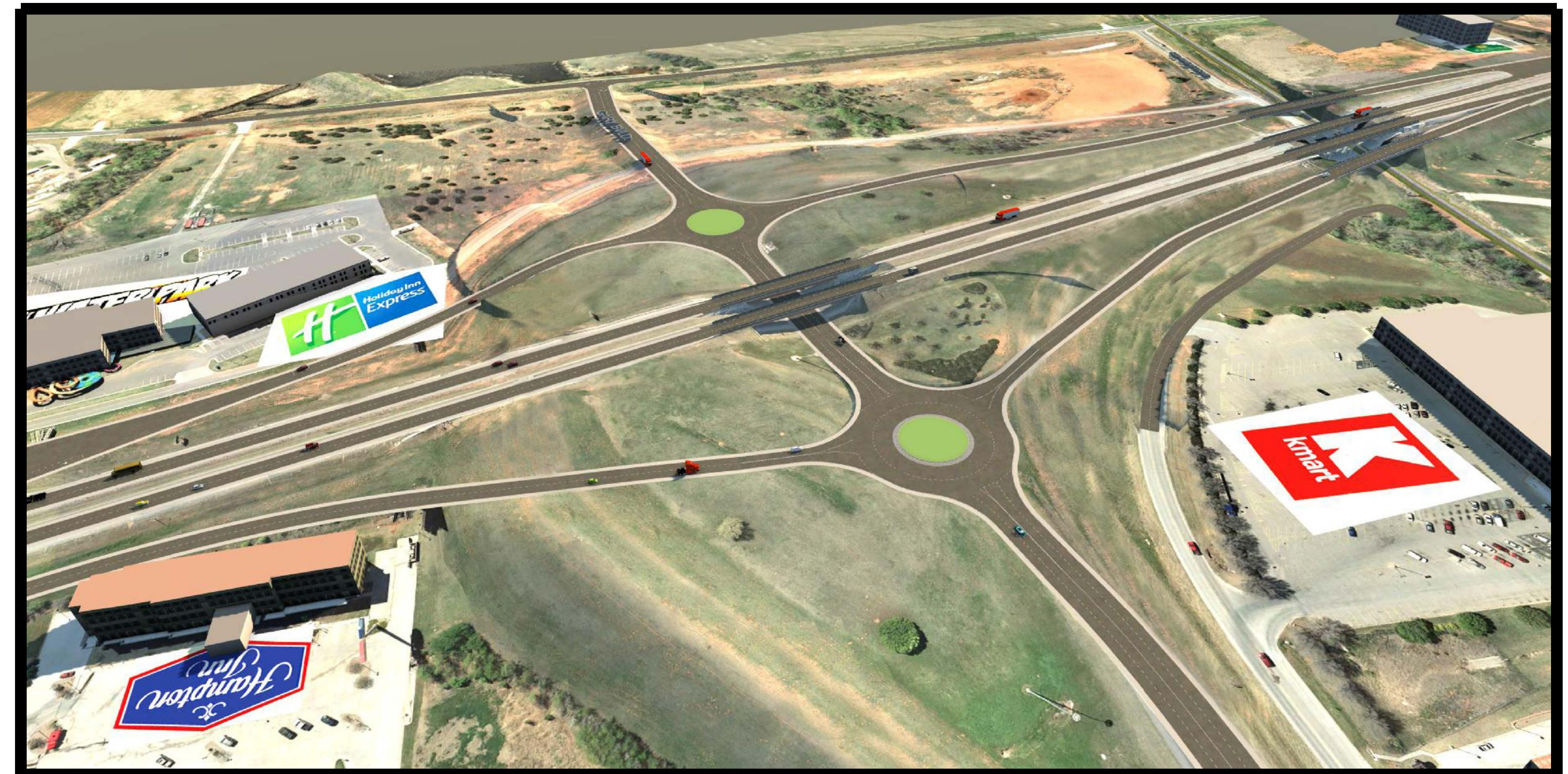
MODERN ROUNDABOUT INTERCHANGE