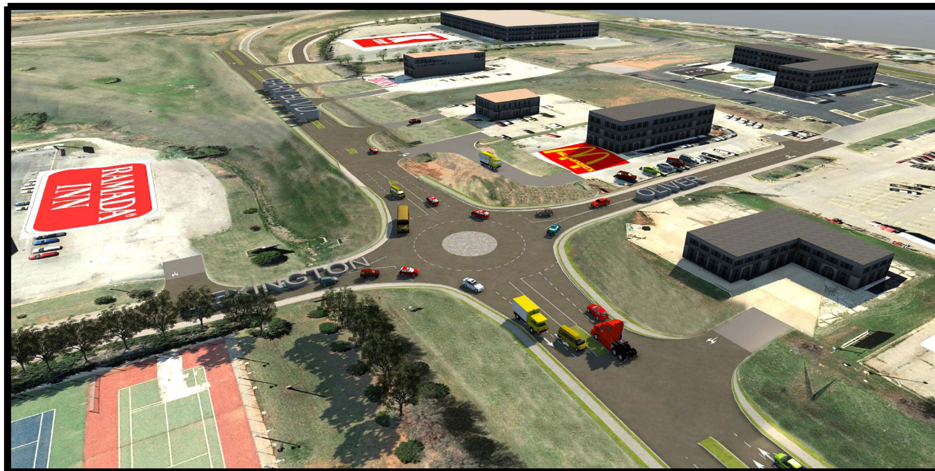
MODERN ROUNDABOUT INTERSECTION