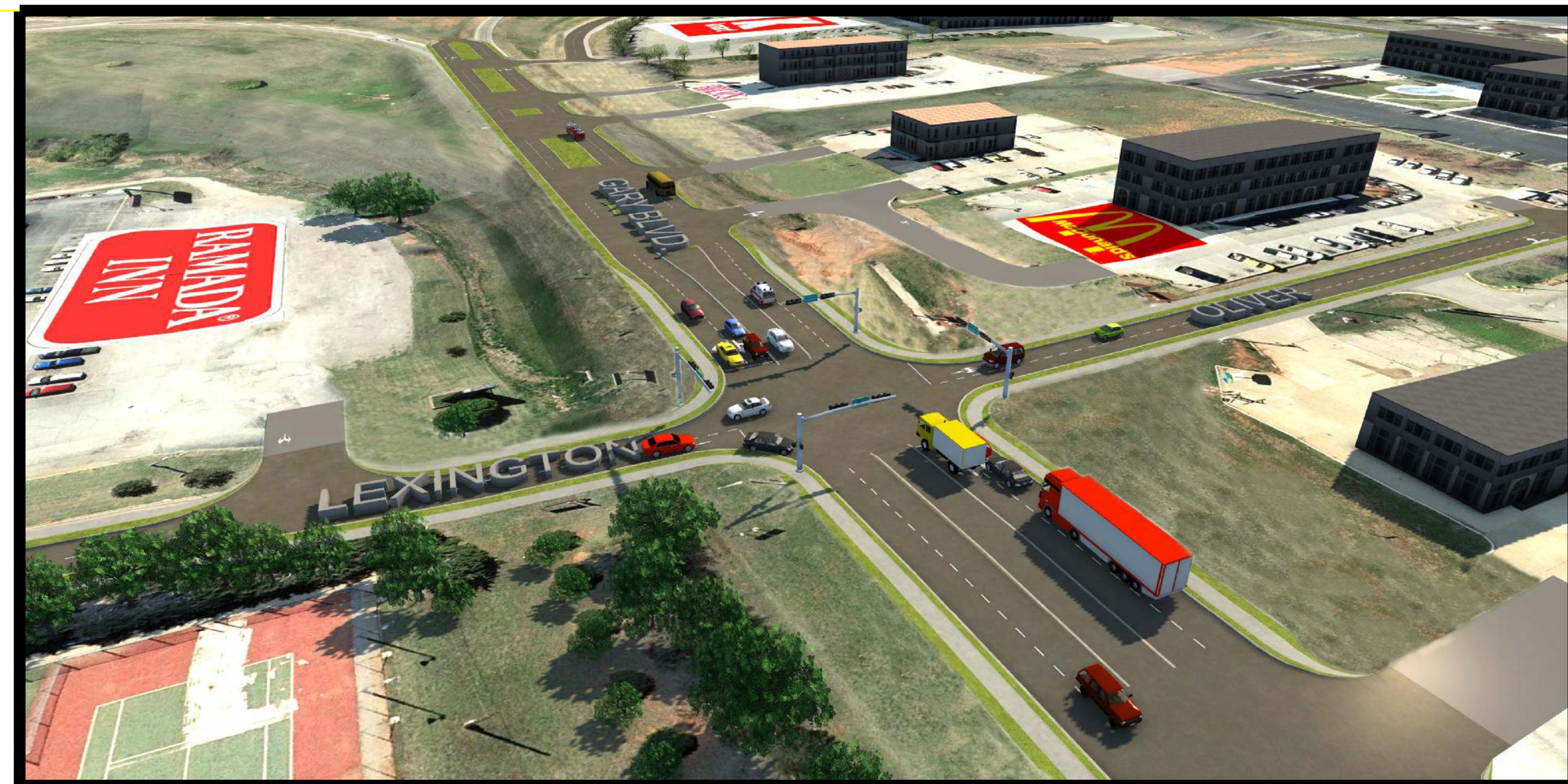
TRADITIONAL 5 LANE INTERSECTION