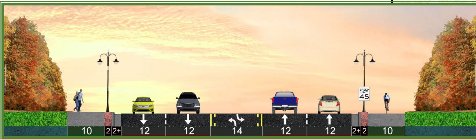
FIVE LANE SECTION