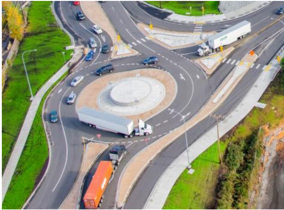
Example 3-Leg Roundabout