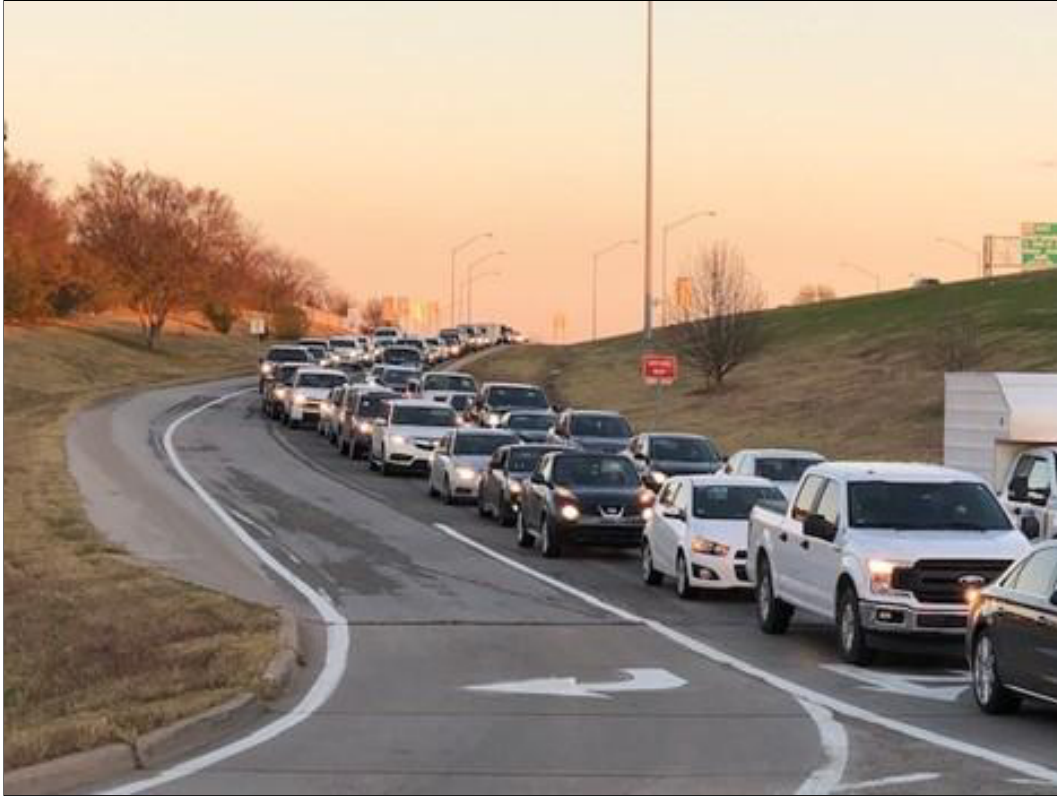
Pictured above: Congestion on the westbound exit-ramp

Memorial Drive at this location carries approximately 47,000 vehicles per day (vpd) near the interchange and has heavy traffic on the Creek Turnpike ramps. The east side ramps carry over 10,000 vehicles per day. Due to these ramp volumes and overall heavy traffic on Memorial Drive, congestion at the interchange is common with backups occurring on Memorial Drive south of the Turnpike in the AM and on the westbound exit ramp in the PM.