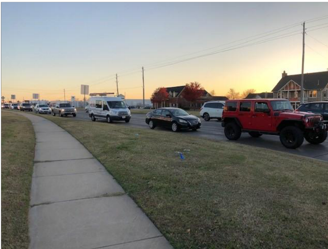
Pictured above: Traffic on northbound Memorial Drive waiting to turn east (to northbound US-169).

Currently, these ramps provide a Level of Service F (rated on an A-F scale – similar to a report card), meaning there is severe delay. Traffic volumes on Memorial Drive are projected to increase to 60,000 vpd by 2045, and congestion is anticipated to worsen in the future as traffic volumes increase.