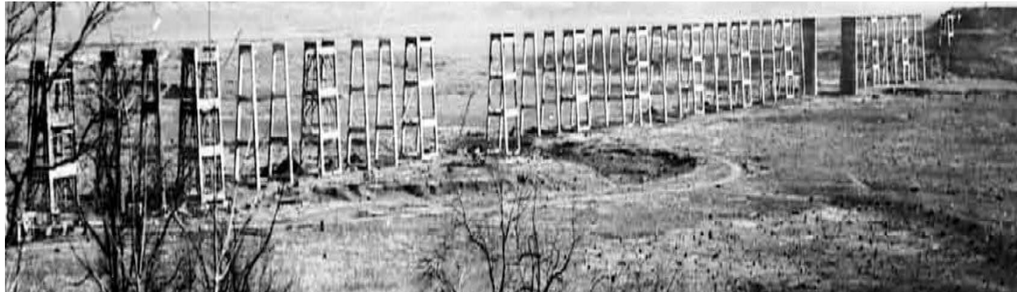
Photo of the construction of the Roosevelt Bridge, early 1940s.

Because it is a significant historic site, the Roosevelt Bridge is considered a Section 4(f) property. Removal and replacement of the Roosevelt Bridge would be considered a use of the resource. Therefore, ODOT must study alternatives that would preserve the historic integrity of the bridge.