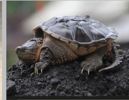
Alligator Snapping Turtle