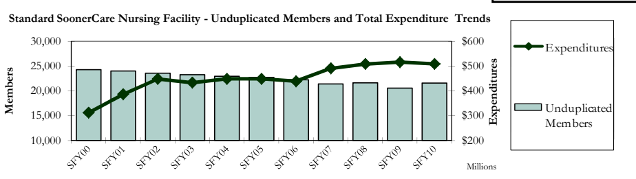
Data \ as \ of \ Oct. \ 15, 2010. \ Figures \ do \ not \ include \ intermediate \ care \ facilities \ for \ the \ mentally \ retarded \ (ICF/MR).