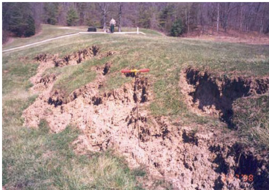
Large slide on embankment with prominent slope

These cracks should close as climatic or soil moisture conditions change.