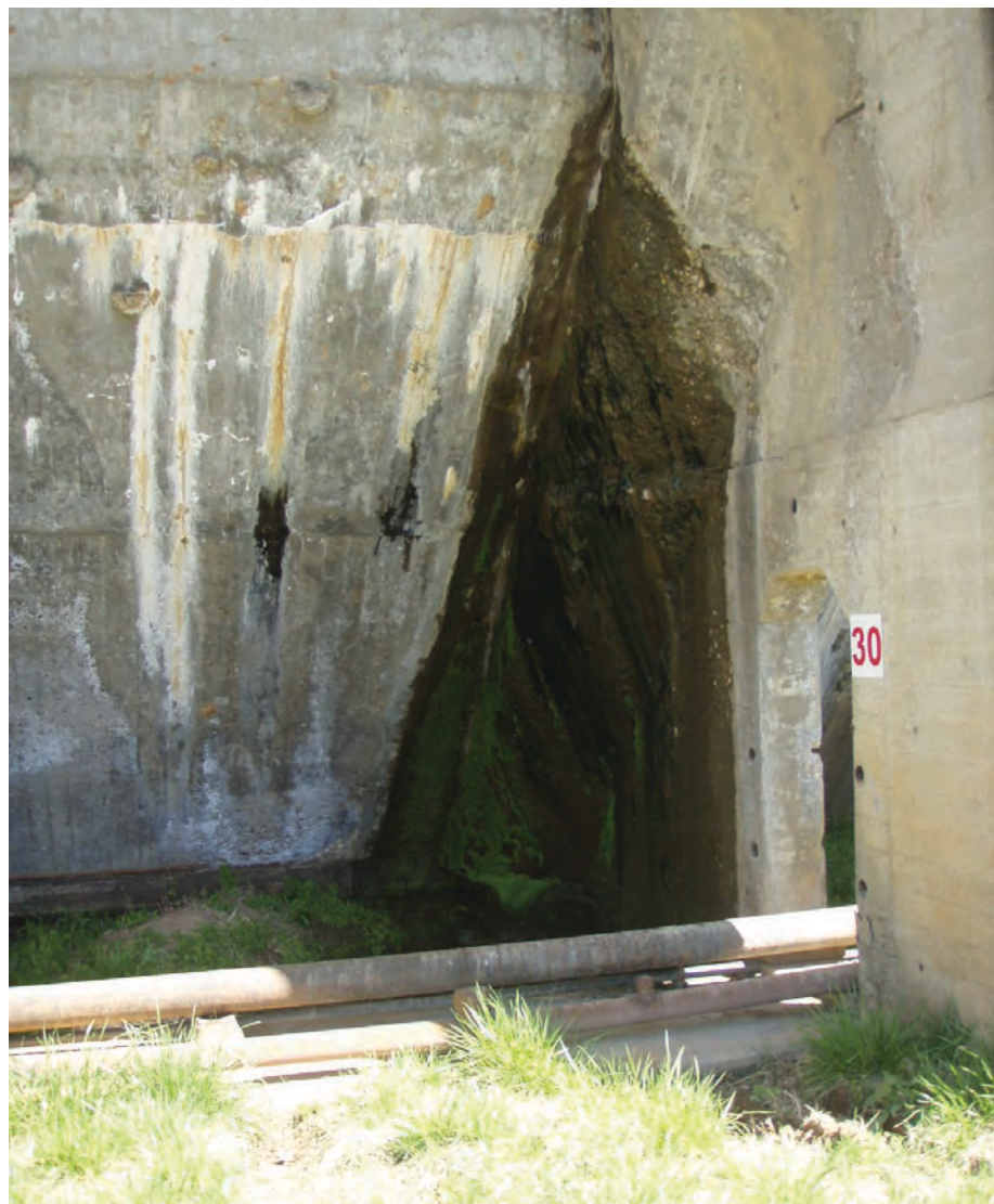
Vertical crack in dam allowing seepage

The key to a successful maintenance program is the establishment of a task schedule and strict adherence to it.