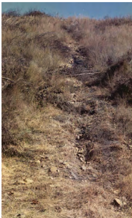
Erosion of dam embankment