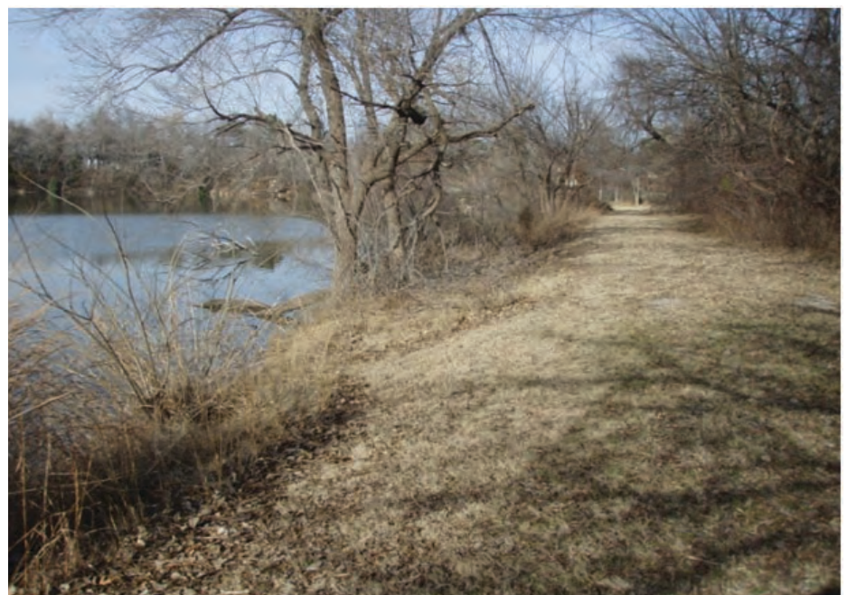
Trees and Woody Brush Growing on the Dam.

When deficiencies prevent riprap from providing erosion protection,