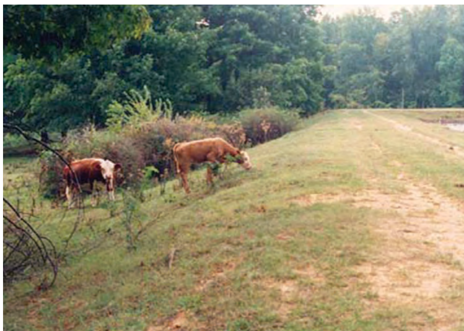
Cattle on Embankment of Dam

Burrowing animals (beaver, muskrat, groundhogs, and others) are naturally attracted to the habitats created by dams and lakes; however, their presence can endanger the structural integrity and proper performance of embankments and spillways.