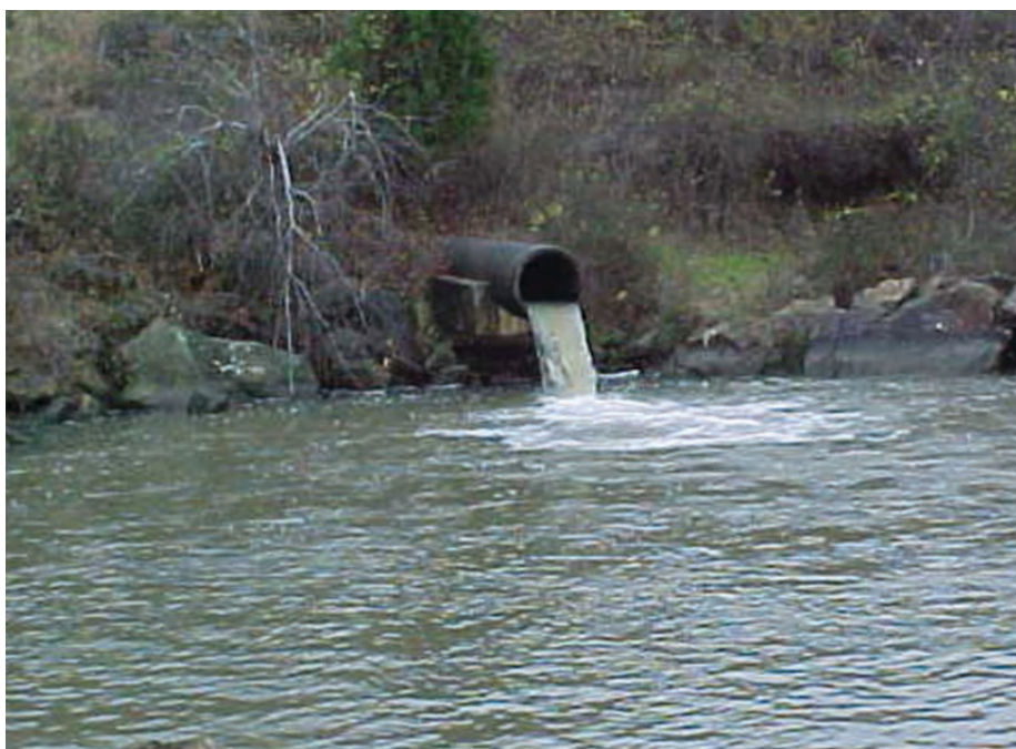
Outlet Pipe and Plunge Pool