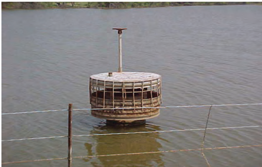
Trash Rack Over Inlet Pipe

with cement grout are possible long-term solutions, but pressure cement grouting is an expensive and sometimes dangerous procedure and can cause hydraulic fracturing. Grouting should be performed only under the direction of an engineer.