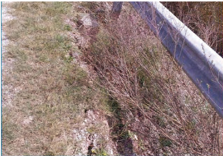
Longitudinal crack displaces guardrail