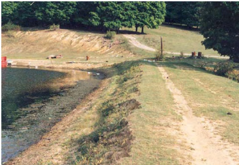
Wave erosion on upstream slope of dam.

Berms on the downstream face that collect surface water and empty into these gutters add to the runoff volume. Sod surfaced gutters may not adequately prevent erosion in these areas. Paved concrete gutters may not be desirable because they do not slow the water and can be undermined by erosion. Also, small animals often construct burrows underneath these gutters, adding to the erosion potential.