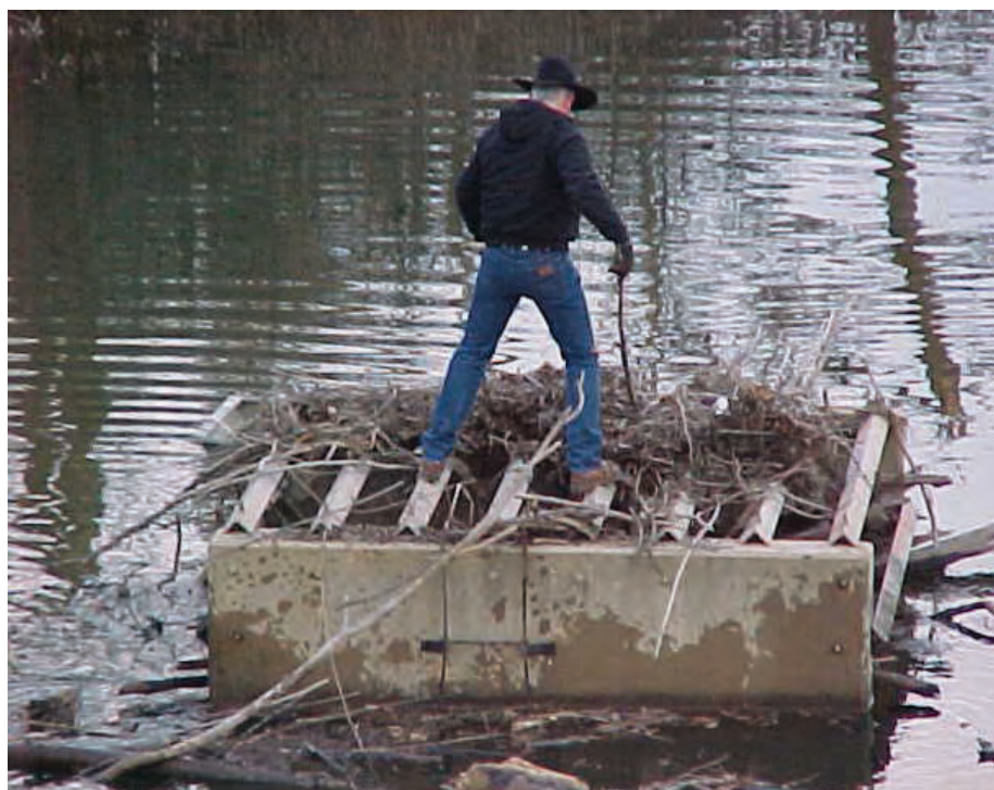
Trash Rack With Debris