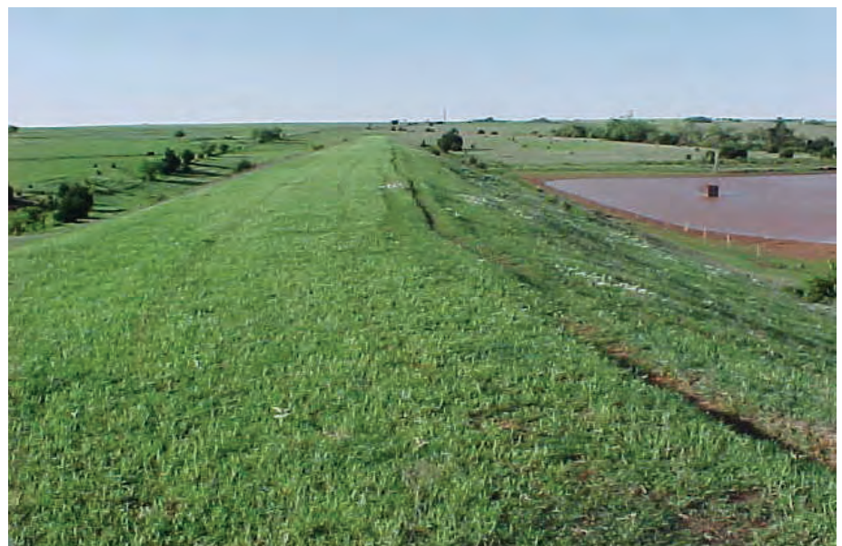
Well maintained dam

Preventive maintenance assures that the dam and lake are in good working condition and precludes more harmful conditions from developing. This includes such tasks as mowing, repairing eroded areas, and removal of burrowing animals. Individual maintenance tasks should be itemized on a list, with a description of the area where the maintenance is to be performed, the schedule for performing the tasks, and reporting procedures. Typical routine maintenance tasks performed at most dams include mowing grass, removing brush and trees, removing litter and other debris, regrading the crest and/or access roads, repairing fencing to keep livestock off the dam, removing