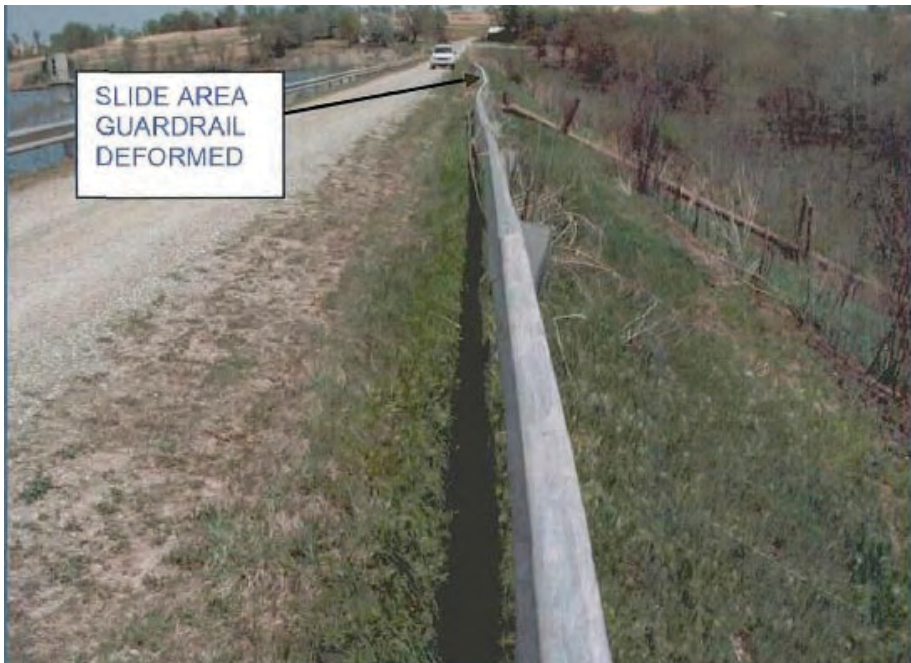
Embankment slide moves guardrail

The following maintenance procedures should not be used to solve serious problems. Conditions such as embankment slides, structural cracking, and sinkholes threaten the safety of a dam and require immediate repair under the direction of a professional engineer.