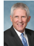
Donald Pape Appointed by the Senate President Pro Tempore