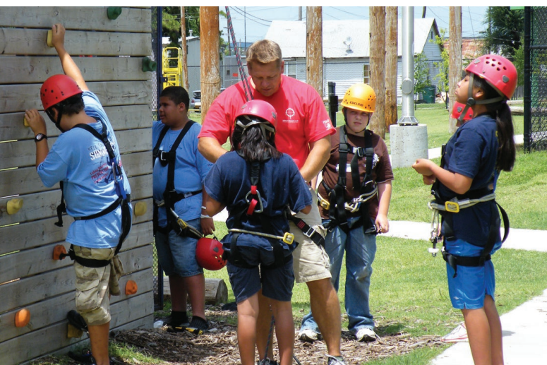
Youth participating in Wellness Adventures.