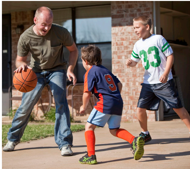
The Shape Your Future public education campaign promoted fun ways families could incorporate physical activity into their daily activities.

In each case a statewide, comprehensive program is required to stem the tide of preventable disease, disability, and death. In addition, the board has funded