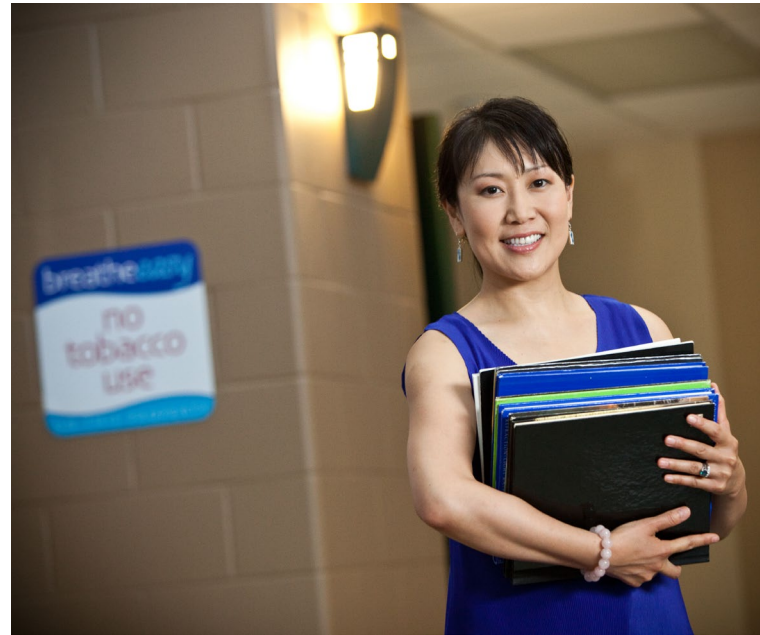
The Shape Your Future campaign also promoted being tobacco free and avoiding toxic secondhand smoke.

The Oklahoma Insurance Department, Oklahoma Hospital Association, Oklahoma Department of Mental Health and Substance Abuse Services, and Oklahoma Health Care Authority continued their work to promote insurance coverage of tobacco cessation, establish tobacco cessation systems through hospitals and health systems, integrate tobacco dependence treatment within mental health and substance abuse programs, and within health care settings serving pregnant women, respectively. The FY12 budget was $770,000.