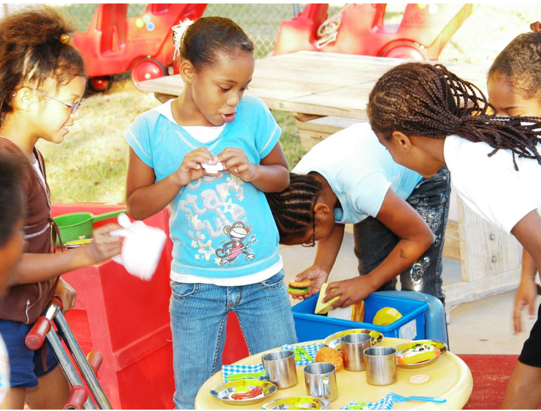
Through a grant with the Oklahoma Child Care Association, TSET supports the development of education tools to teach children and childcare providers about a tobacco-free and healthy lifestyle.